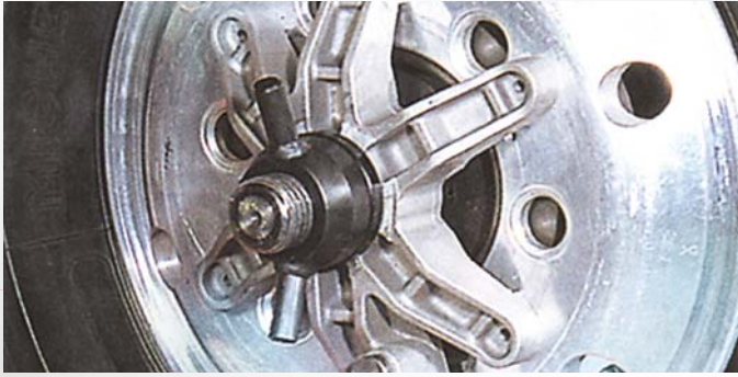
Adaptor assembly (220 – 280 mm Ø)