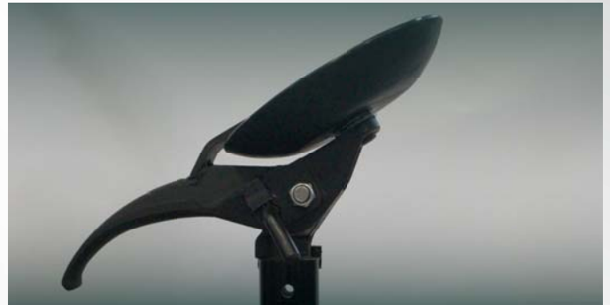
Bead breaker The bead breaker disc is equipped with a special tilting system in order to increase bead breaking effort and to make sure the bead breaking disc is always in optimum position relative to the rim.