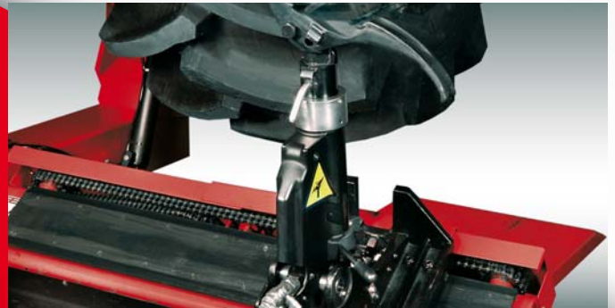
Mounting tool The tool can rotate irrespectively of arm position.