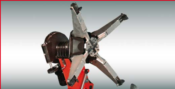
Extremely vast clamping range Clamping range of 14" – 58" without extensions – long jaws accommodate rims of high offset (for King 58 series).