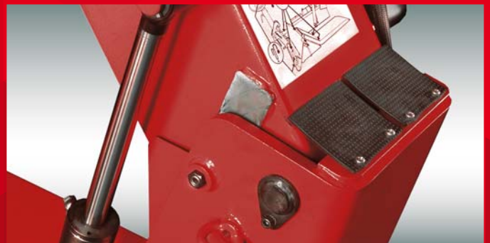
Special design Adjustable studs ensure long life of the chuck arm hinge.