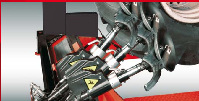
Adjustable tool support.